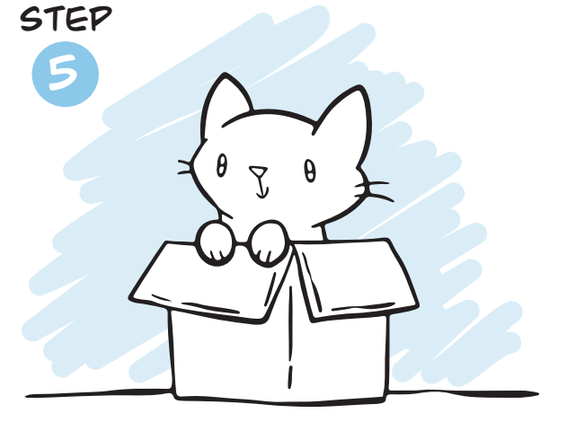
COLOR YOUR KITTY AND SHARE!