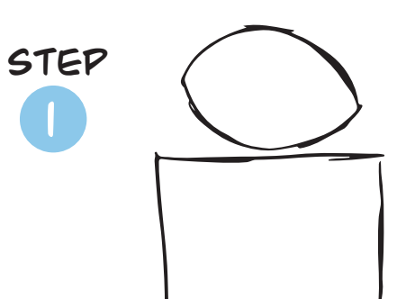
GRAB YOUR PENCIL! SKETCH A FOOTBALL AND A SQUARE.